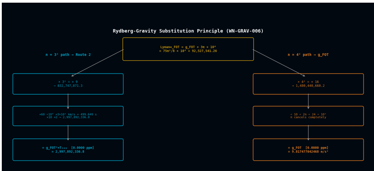
Figure 2: The Rydberg-Gravity substitution table. Both the n=3^2 (left, cyan) and n=4^2 (right, orange) branches return gravitational constants at 0.0000 ppm precision.

Algebraic proof: \text{Lyman}\infty_{\text{FOT}} \times 16 / (10 \times 2\pi \times 24 \times 10^5) = [75\pi^2/8 \times 10^6 \times 16] / [480\pi \times 10^5] = [1200\pi^2/8 \times 10^6] / [480\pi \times 10^5] = [150\pi \times 10^6] / [480 \times 10^5] = 150\pi/48 = 25\pi/8 = g_{\text{FOT}} . \pi cancels completely from the \pi^2 in \text{Lyman}\infty_{\text{FOT}} and the \pi in the 2\pi denominator, leaving a pure \{2, 3, 5\} rational close on g_{\text{FOT}} .