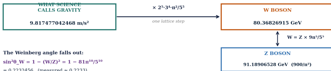
Figure 2. The carriers on the lattice — and the W is the free fall, one step up

The Weinberg angle falls out: \sin^2\theta_W = 1 - (W/Z)^2 = 1 - 81\pi^{10}/5^{10} = 0.2232456 (measured ≈ 0.2233)