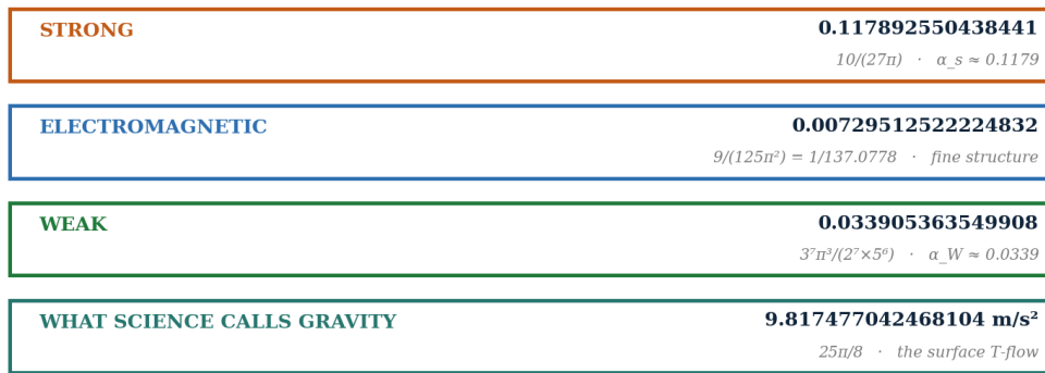
Figure 1. Four forces — four readings of one T-field on a single lattice

One substance, time, read four ways. Every combination of the four is itself a clean {2,3,5,π} value — that is the unification, no fudge constant required.